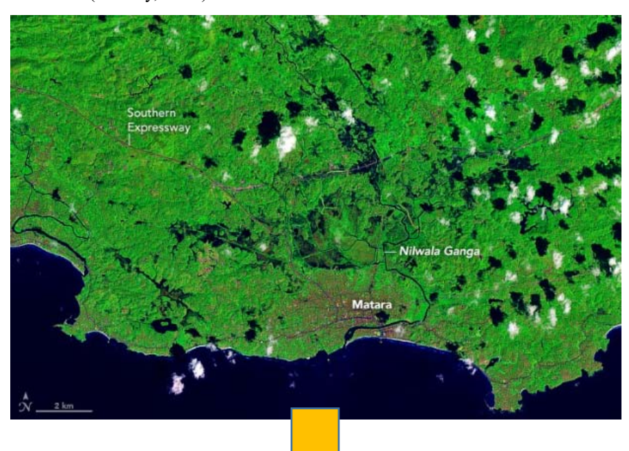
AFTER (late May, 2017)